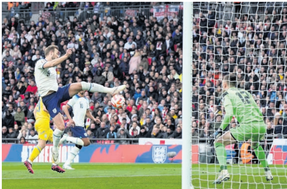
Englands' Harry Kane, left, makes an attempt to score past Ukraine's goalkeeper Anatoliy Trubin during the Euro 2024 group C qualifying soccer match between England and Ukraine at Wembley Stadium in London, Sunday, March 26, 2023.

With that double strike England effectively secured the victory and ensured a 100% start to qualifying for Euro 2024 in what has been an impressive response to the disappointment of being eliminated from last year's World Cup at the quarterfinal stage. □